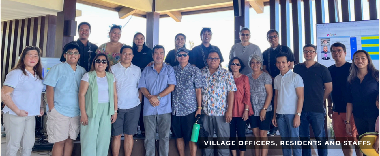
VILLAGE OFFICERS, RESIDENTS AND STAFFS